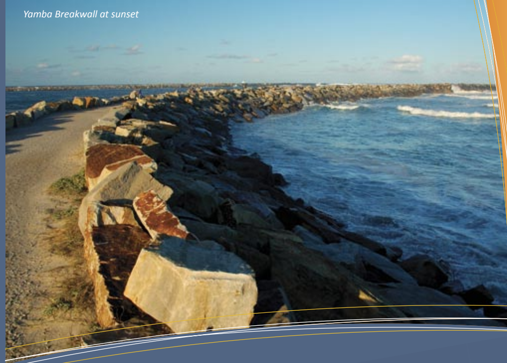
Yamba Breakwall at sunset